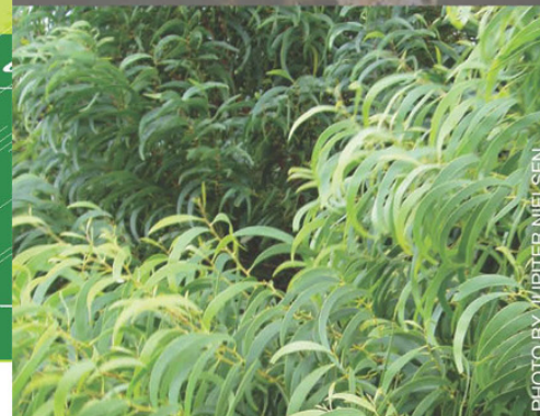
'Iliahi/Sandalwood ( Santalum haleakalae )